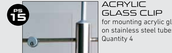
ACRYLIC GLASS CLIP for mounting acrylic glass on stainless steel tubes. Quantity 4