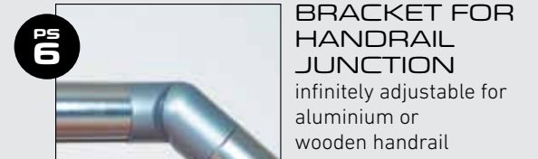
BRACKET FOR HANDRAIL JUNCTION infinitely adjustable for aluminium or wooden handrail