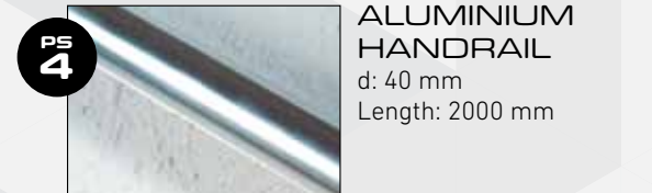
ALUMINIUM HANDRAIL d: 40 mm Length: 2000 mm