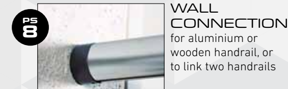
WALL CONNECTION for aluminium or wooden handrail, or to link two handrails