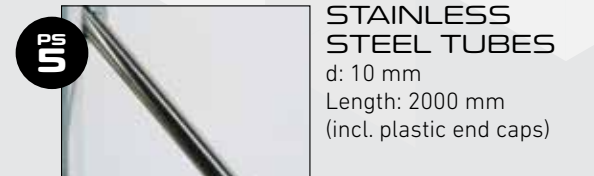
STAINLESS STEEL TUBES d: 10 mm Length: 2000 mm (incl. plastic end caps)