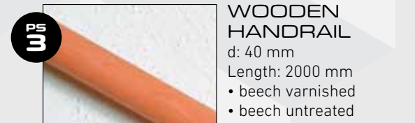
WOODEN HANDRAIL d: 40 mm Length: 2000 mm • beech varnished • beech untreated • pine untreated