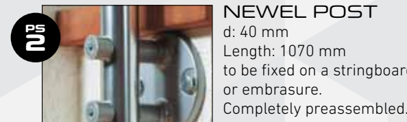
NEWEL POST d: 40 mm Length: 1070 mm to be fixed on a stringboard or embrasure. Completely preassembled.