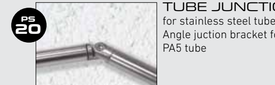
TUBE JUNCTION for stainless steel tubes Angle junction bracket for PA5 tube