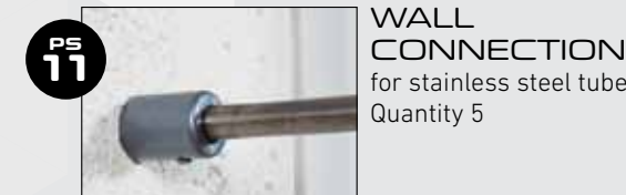
WALL CONNECTION for stainless steel tubes Quantity 5