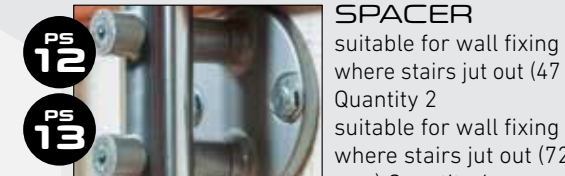
SPACER suitable for wall fixing where stairs jut out (47 mm) Quantity 2