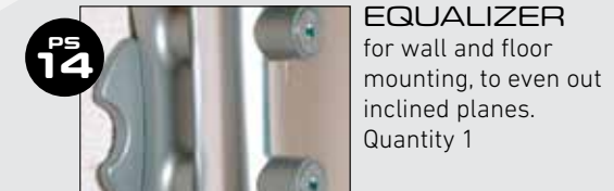
EQUALIZER for wall and floor mounting, to even out inclined planes. Quantity 1