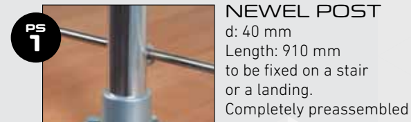
NEWEL POST d: 40 mm Length: 910 mm to be fixed on a stair or a landing. Completely preassembled

Look out for suggestions and visit dolte.com/pl where you will find information on dimensions and assembling the banister system.